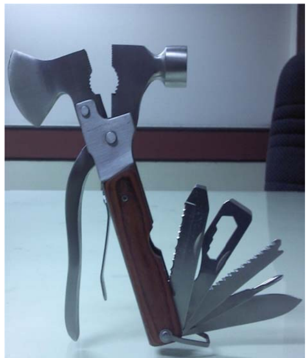
Axe - Hammer combination Tool'